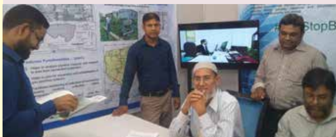
CEGIS Stall in the Digital World 2016