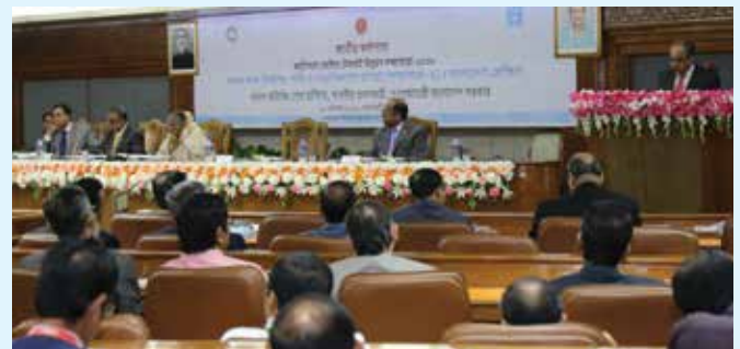
Mr. Anisul Islam Mahmud, M.P, Honorable Minister, Ministry of Water Resources is delivering his speech at the National Workshop

The day-long National Workshop titled “Clean Water and Sanitation (SDG 6): Bangladesh Context” was held at the Prime Minister’s Office on 20 November, 2016 and the Draft Action Plans on SDG 6 were shared with the stakeholders. The Draft Action Plans were finally improved with the feedback received from the participants of the workshop. High level decision makers along with renowned experts on water sector and stakeholders attended the workshop.