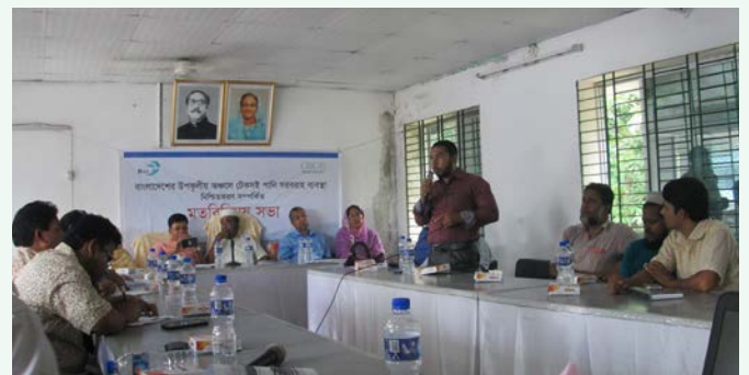
Public Consultation Meeting at Morrelganj Upazila

Finally, from the situation analysis of existing levels of access to water supply for the coastal population, it was recommended in details that for ensuring sustainable access to water supply in the coastal zone of Bangladesh, it is important to actively pursue water resource augmentation, policy and regulatory functions, appropriate infrastructural support and social empowerment.