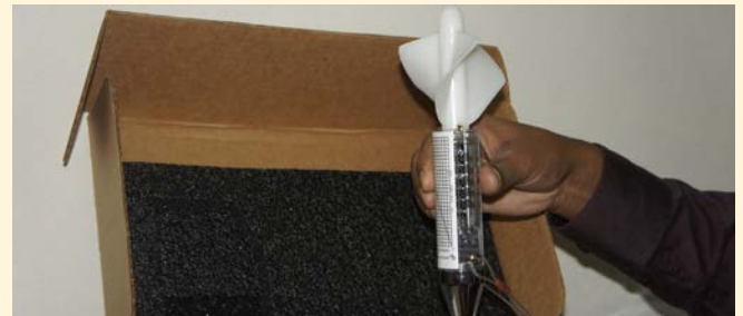
Digital Flow Meter

interval. To be more reliable and scientific in data collection, CEGIS is developing its own Environmental Laboratory for the assessments of Water, Land and Noise Quality of a given geographical settings. Presently, CEGIS is fully capable of Dust and Air quality