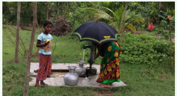
Women collecting drinking water from tubewell in Suborno Char

The study further shows that shallow tube-well is the main source for drinking water in Char Clerk, Nowabpur and Ranapasha Unions. Moreover, in general, people use pond water for domestic purposes. However, the number of tube-well is gradually increasing in all of these unions. On the contrary, in saline-prone unions such as Nishanbaria, Char Duanti, and Buri Goalini, the main sources of drinking water are rain water and pond water. But storage capacity of rain water is low compared to that of the requirement. In these places, ground water is saline and surface water becomes saline and dirty during dry season. Salinity is also an increasing challenge in Char Clerk Union.