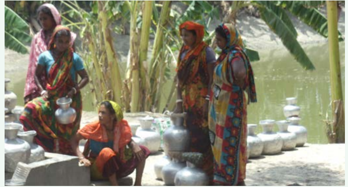
Women collecting drinking water from PSF at Buri Goalini

collection of water when the villagers need to buy water from the market. From the study, it was found that all the six sample unions show heavy dependence on shallow tube-well and deep tube-well during dry period, with severe stress on health of young men and women, in particular, to fetch water. People of Char Clerk, Nowabpur and Ranapasha, mentioned that since the coverage of tube-well is low in close neighborhood, they cannot collect drinking water during night time from distant locations as women's security is involved.