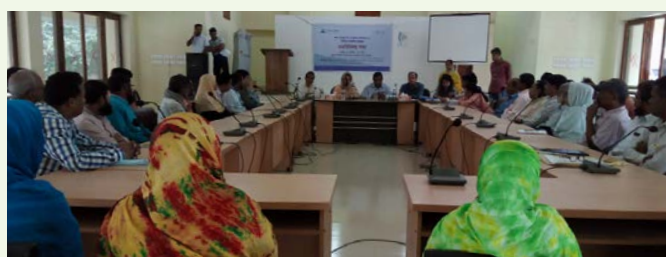
Public Consultation Meeting at Tangail Sadar Upazila

Resilience varies from one community to another and from one region to another. With a view to assess resilience in the flood prone delta areas, CEGIS is jointly conducting a research study with the Wageningen University and Research Centre (WUR), Wageningen, Netherlands and the Vietnamese counterparts. For developing a flood resilience framework for Bangladesh Delta, the Tangail District, one of the frequently flooded districts of the country, has been selected. This area experienced devastating floodings in 1988, 1998, 2002, 2004, 2007 and recently in 2017. This district is in the north central region of Bangladesh and located at the northern corner of the capital city, Dhaka. Tangail District is part of the Jamuna-Brahmaputra River deltaic region. The study covered the Compartmentalization Pilot Project (CPP) area of the Tangail District. Through FCDI projects, embankments and drainage structures were built to manage flood risks. The CPP area showcase controlled flooding and drainage using the concept of 'Compartmentalization' through structural