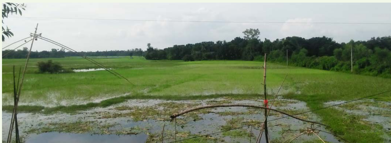
Floodplain at Dainya Union Parishad under Tangail Sadar Upazila