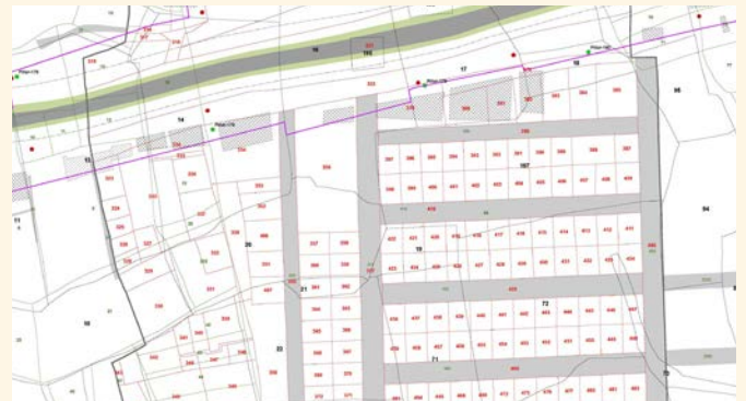
Digital Map preparation with detail land information

In this connection, BWDB Land and Revenue Directorate has taken initiative to produce a digital database of BWDB asset and land acquisition map, for a strip of approximately 20km length starting from Gabtoli to Abdullahpur covering 19 Mauzas.