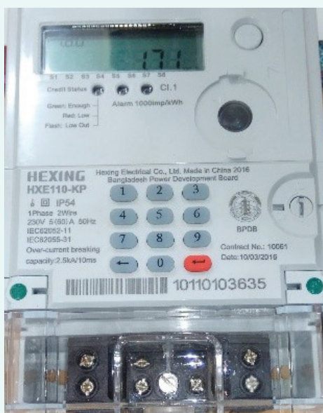
Electronic Energy Meters of BREB

The financial and economic analysis of the project shows that the proposed project is feasible, both financially and economically. Financially, the benefit of the project would be 20% higher than all the costs. The economic benefit of the project is much higher than the financial one, signifying that the project would be beneficial to the entire economy and would contribute significantly to country's GDP. The economic sensitivity analysis shows that the project is more sensitive to increase in cost than decrease in benefit. The project remains viable (economic IRR of 14.5%) even in the worst case scenario. In the best case scenario, the IRR reaches its highest level of 25.2%.