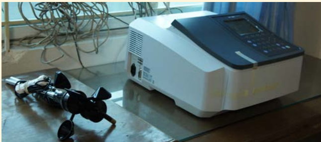
Ultra Violet Visible Spectrophotometer

monitoring in both indoor and outdoor environment through hand held devices. Number of soil physical quality assessment equipment such pH, Salinity and Moisture are now available in this laboratory. Moreover, this Environmental Laboratory is fully capable of monitoring various surface and ground water