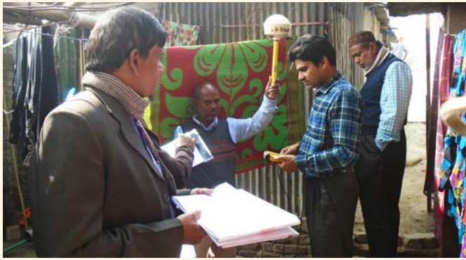
Land survey using DGPS

Bangladesh Water Development Board (BWDB), one of the largest government agencies in Bangladesh is engaged in micro planning, designing and implementing environment friendly water resources projects such as flood control, drainage and irrigation, riverbank management, capital dredging of rivers, coastal embankment, and land reclamation, which are contributing directly to food production.