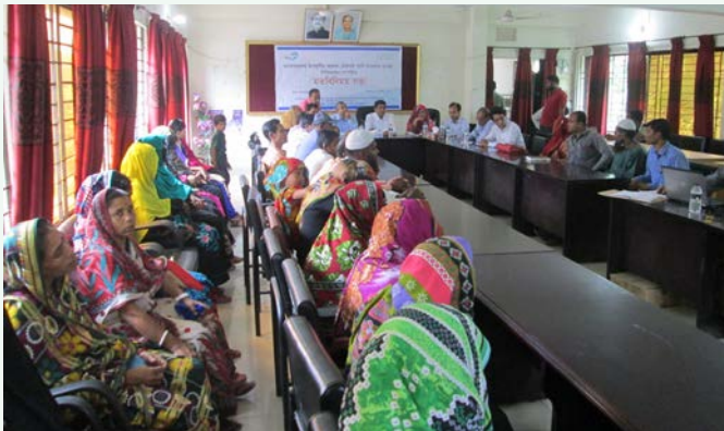
Public Dissemination Meeting at Patharghata Upazila

Bangladesh Water Partnership (BWP) has entrusted a study to CEGIS for exploring the challenges of sustainable access to water in the coastal zone of Bangladesh with particular focus on women and youth in reference to the current context of climate change and to provide relevant suggestions to ensure sustainable access to water supply in the coastal zone. Objectives of this study have been set accordingly to assess water supply and situation for household use, drinking, health, hygiene and livelihoods in the coastal zones and to propose pragmatic measures to ensure sustainable access to water, at a limited scale by giving particular focus on women and youth.