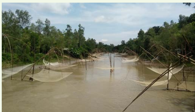
Loubojong River in dry season

Utilizing the field level findings obtained from the case studies of Bangladesh and Vietnam and based on the experience of the experts of the Netherlands along with analysis on flood risk, the resilience brigade will assess the resilience of the community people living in the dynamic deltas.