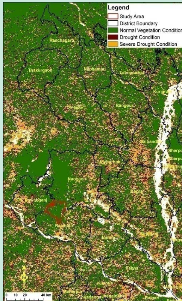
Drought Severity Map for the period 14-22 September 2017

Climate change induced natural disasters especially the drought risk has gradually been increased and impacting the crop agriculture of the country. The study upazila is also highly drought vulnerable due to changing climatic and hydrological conditions. The drought conditions i.e. water stress and water shortage conditions in the dry period is also adversely affecting the social and economic development of Bangladesh. However, the water stress condition in the soil impacted on the crop quickly and resulted in yield reduction. Water stress condition denoted as the drought which impacted environment, agriculture as well as livelihood in the study area. So far, Bangladesh faced 3 categories of droughts, they are (i) Meteorological Drought, (ii) Hydrological Drought, and (iii) Agricultural Drought. The Drought Severity Index study was concerned with Agricultural Drought Severity Index for a specific upazila and specific crop season. Thus the study was conducted at Tanore Upazila under Rajshahi