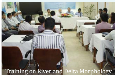
Training on River and Delta Morphology