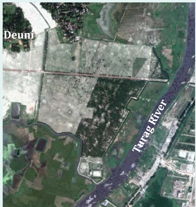
Signature of Land Development within Land filled Area, Deuni 25 April 2018