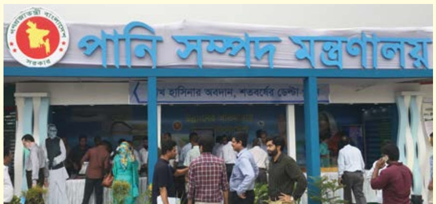
Organizers and participants of the Development Fair

Honorable Prime Minister Sheikh Hasina has inaugurated the 4th National Development Fair 2018 across the country through a Video-Conference from her official residence (Gonobhaban) in the City on 4th October 2018, Thursday at 11.00 am. The slogan of the Development Fair - 2018 was 'Indomitable Bangladesh on March Towards Development'.