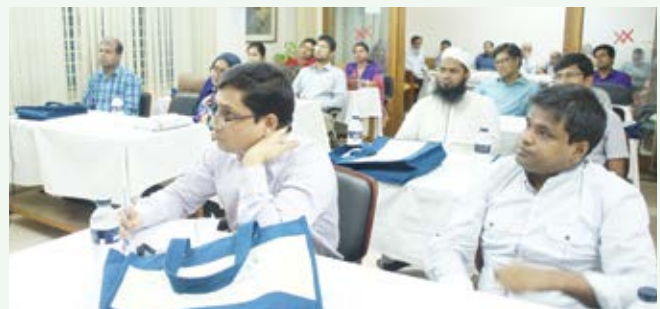
Participants of the ESIA Training

participants visited the Main River Flood and Bank Erosion Risk Management Program of BWDB located in Harirampur, Manikganj where they gathered practical experiences in conducting ESIA study such as problem identification in consultation with local people.