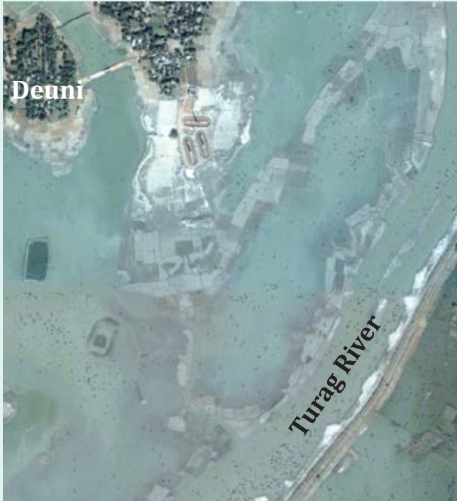
Open Water in Turag River Floodplain, Deuni 13 November 2004

water. However, one large patch and two or three small patches of sand were visible on 6 April 2013 within the flood plain area at Deuni. This indicates the land filling process was started at Deuni. The major portion of the flood plain at Deuni was filled by sand particle within 17 November 2016. After the sand filling process, the land development process started within the land filling portion. Satellite images of 25 April 2018 shows the different land development signatures within the land filling portions like roads and plantation.