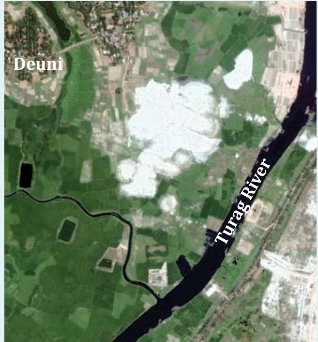
Signature of Some Patches of Sand Particles in Turag River Floodplain, Deuni 6 April 2013