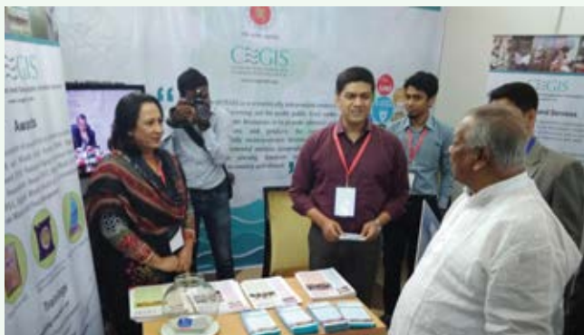
Mr. Amir Hossain Amu, M.P., the then Hon'ble Minister, Ministry of Industries is visiting CEGIS Stall

A three day long 2nd Water Bangladesh International Exhibition 2018 was organized by the Conference & Exhibition Management Services, CEMS Global, Bangladesh at the International Convention City Bashundhara (ICCB), from 25-27 October 2018. The Ministry of Local Government, Rural Development and Co-operatives (LGRD) in association with CEMS Global have organized the exhibition. Mr. Amir Hossain Amu, M.P, the then Hon'ble Minister, Ministry of Industries has inaugurated the exhibition. CEGIS participated