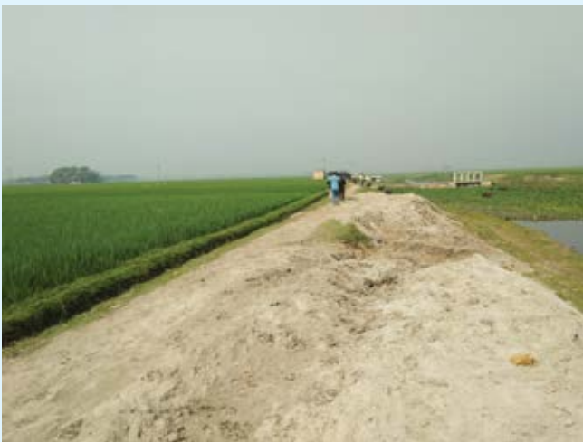
LGED Road for Sarail Upazila to Panisbar Bazar

Road communication infrastructure in the Haor Area is poorly developed, mostly seasonal submersible rural roads providing connectivity during the dry season. Boat is the main mode of communication in the wet season. Poor communication network limits agriculture productivity and rural growth, off-farm employment opportunities and access to existing social services, particularly health and education, which make this area as the most poverty prone area of Bangladesh. Despite of high demand from the local population for better road communication possibilities, Haor Areas are highly environmentally sensitive, because of its fragile ecosystem with rich biodiversity. Any intervention in the area needs careful consideration of