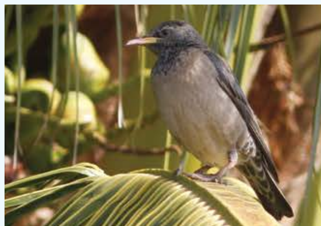
Rosy Starling from Chbera Dwip of Saint Martin's Island

During the first day, the Rosy Starling was foraging alone while following other two days during the study tour it was discovered that both Rosy Starling (migratory bird) and common Myna species (very common Starling species in Bangladesh) were always together, which is an interesting observation. In addition, it was found that they were slow and late moving. Always fly after common starling to reach out a feeding source. Usually, perching tree branches like other starling species. Foraging for feed from common source, agriculture land and other suitable habitat.