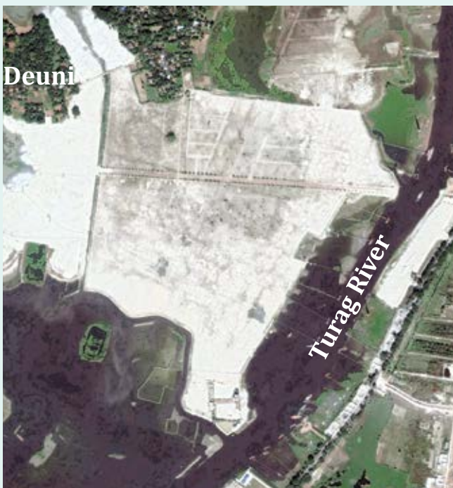
Land Filled Area in Turag River Floodplain, Deuni 17 November 2016